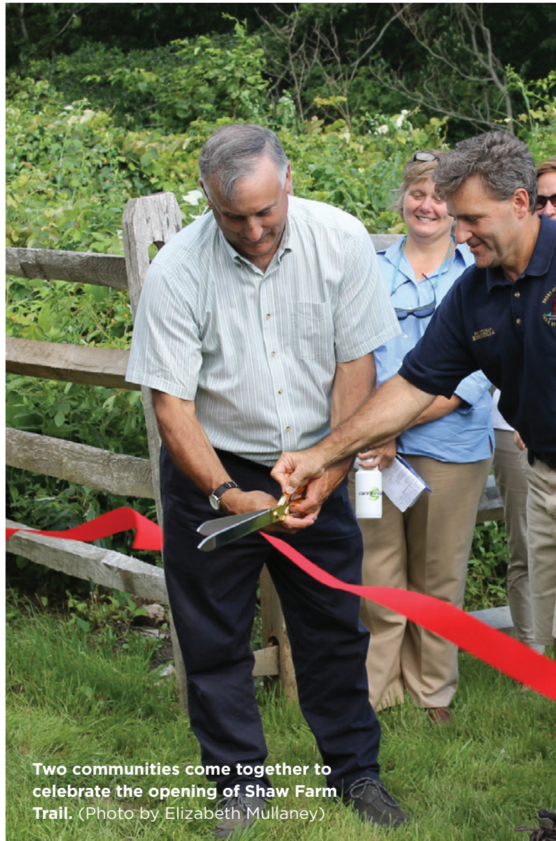
Two communities come together to celebrate the opening of Shaw Farm Trail.