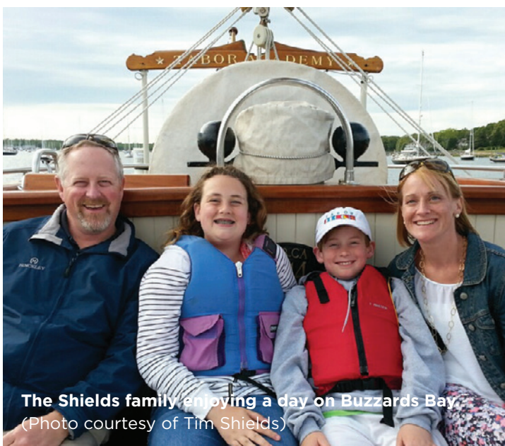
The Shields family enjoying a day on Buzzards Bay.

Your gift to the Annual Fund ensures that together we’ll continue the fight to protect and restore Buzzards Bay. Give today at www.savebuzzardsbay.org/annualfund