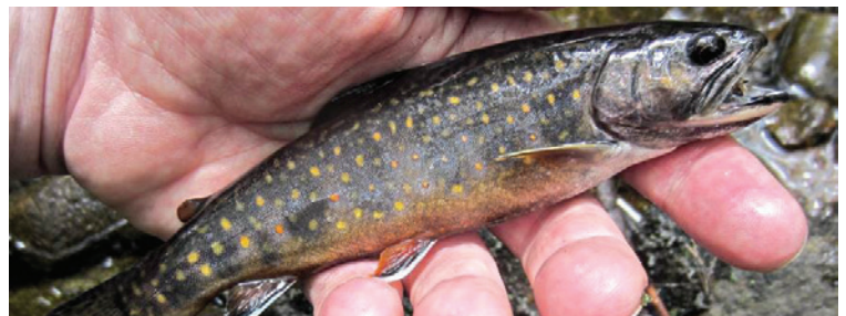
Your support helps protect rare species like the sea-run eastern Brook trout.

With over 25 water quality sampling sites around Westport, the Coalition has documented the Westport Rivers' growing nitrogen pollution problem. This fall, that data helped the state issue a nitrogen reduction target, called a TMDL, to clean up the Rivers.