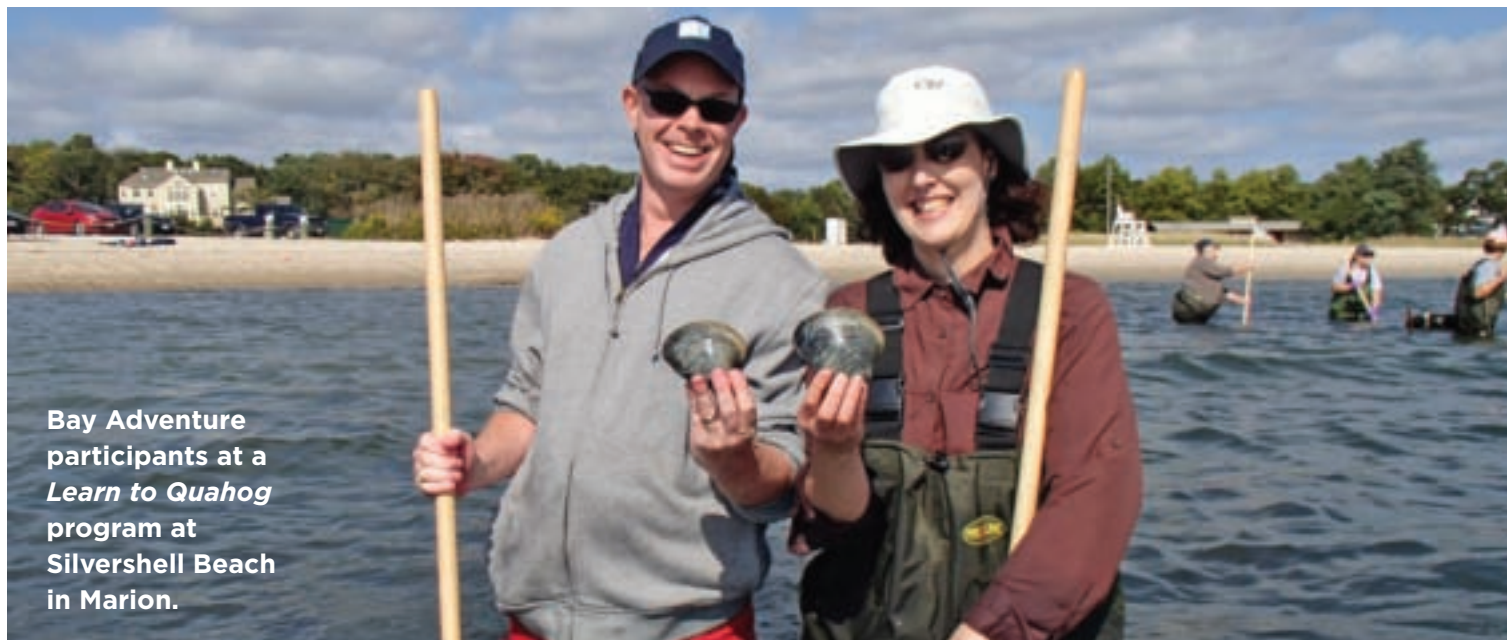
Bay Adventure participants at a Learn to Quahog program at Silvershell Beach in Marion.

Working to protect and restore coastal, river, and drinking water quality for the people of Westport, Dartmouth, New Bedford, Fairhaven, Acushnet, Rochester, Mattapoisett, Marion, Wareham, Carver, Middleborough, Plymouth, Bourne, Falmouth, and Gosnold.