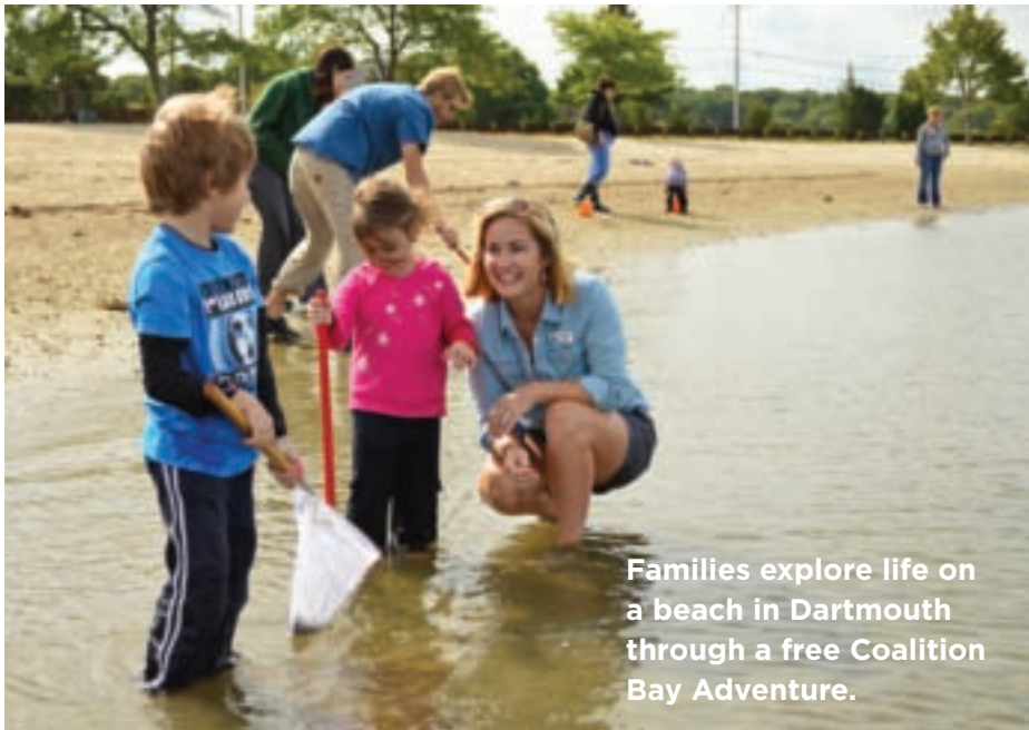
Families explore life on a beach in Dartmouth through a free Coalition Bay Adventure.