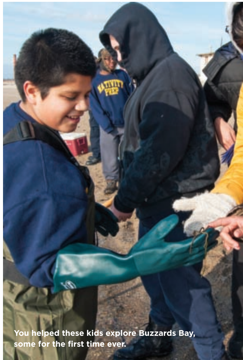
You helped these kids explore Buzzards Bay, some for the first time ever.

The Coalition is making outdoor exploration a universal part of growing up in the Buzzards Bay region. The boy in this story was one of more than 3,000 youth who discovered the Bay with the Coalition this past year.